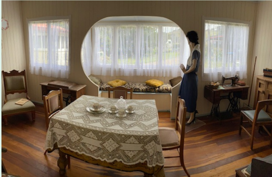
Champion Cottage dining room