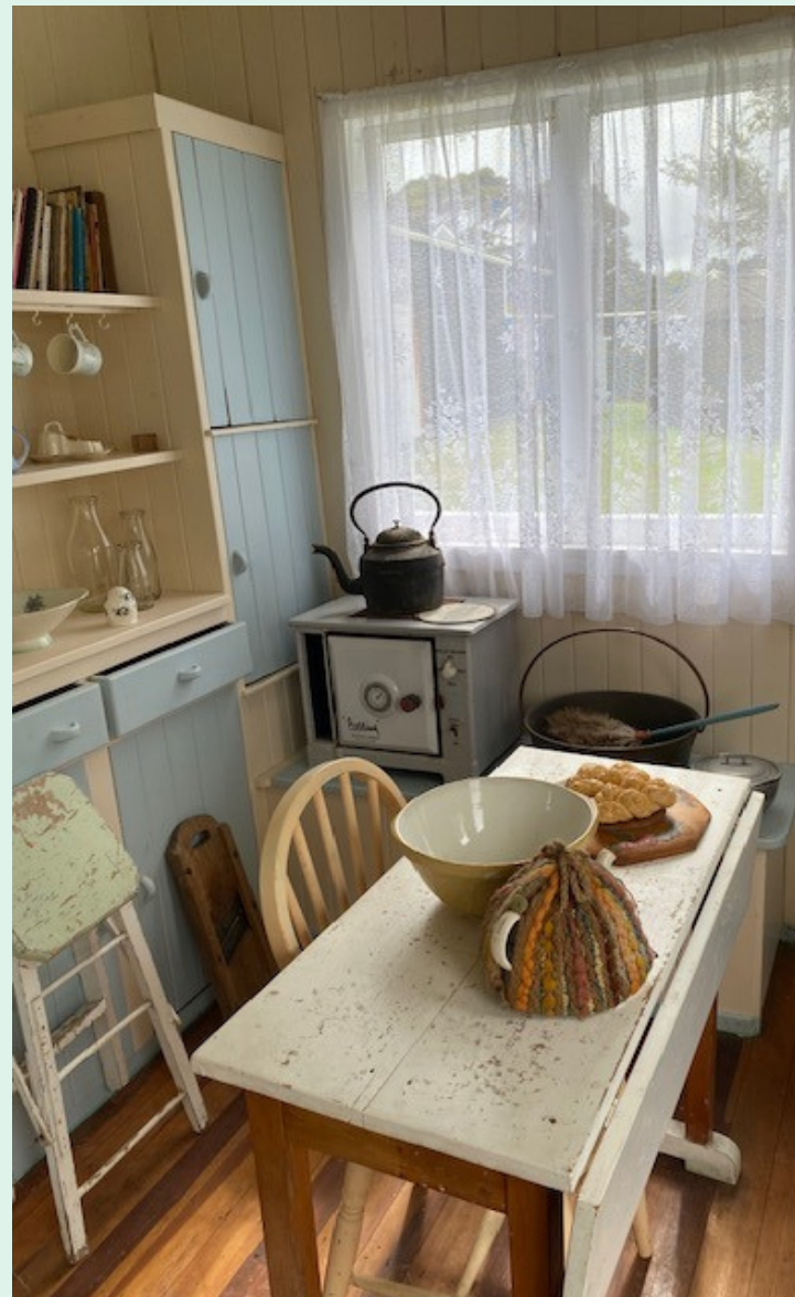
Champion Cottage Kitchen